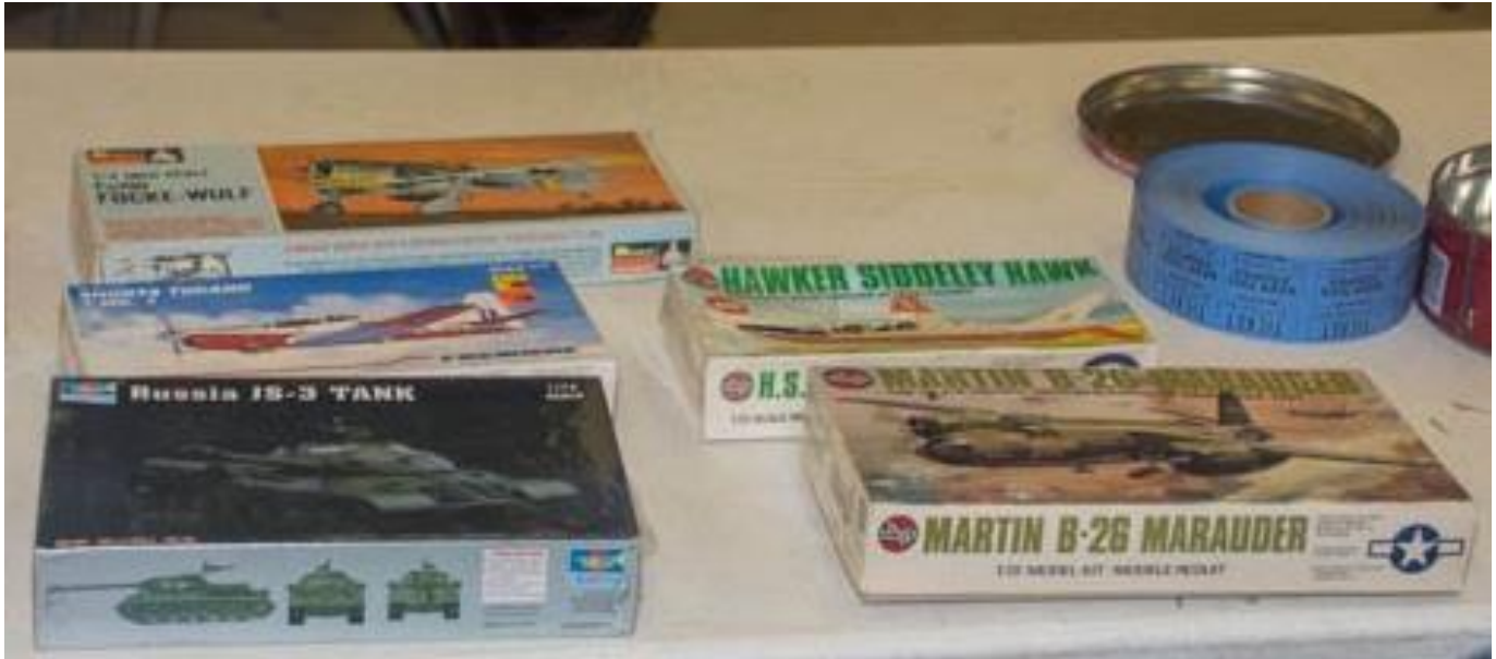
Door prize table