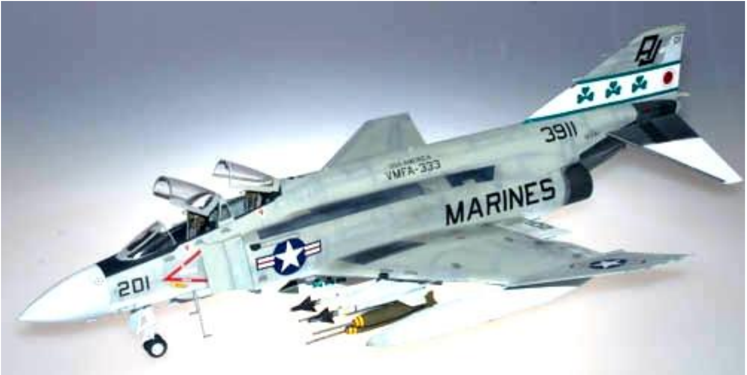
Rick's F-4J VMFA 333